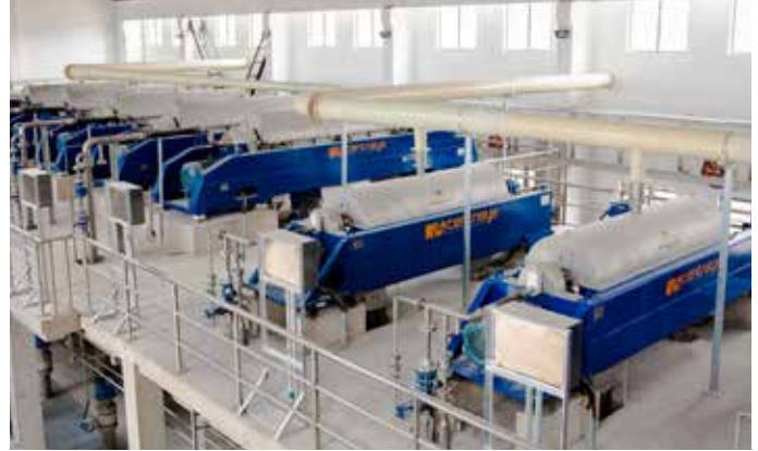
DingFuZhuang WWTP Beijing, China: Five Centrisys THK600 and four CS21-4HC.