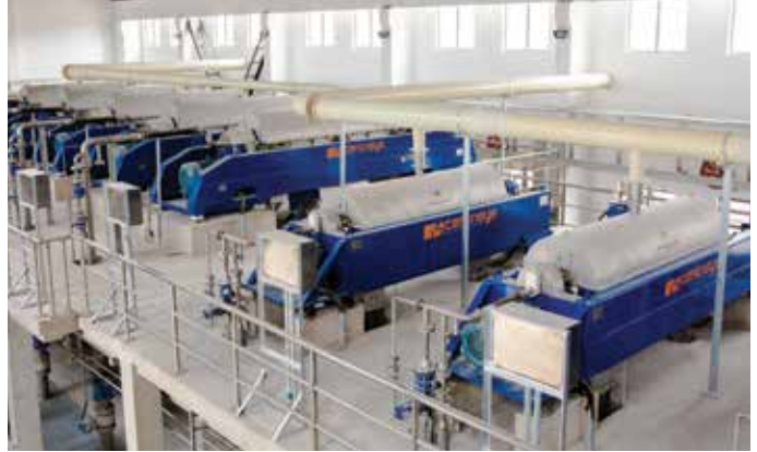
DingFuZhuang WWTP Beijing, China: Five Centrisys THK600 and four CS21-4HC.